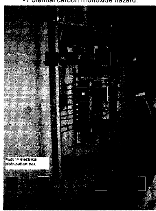
Any rust in the panel is a sign of water leakage. It is unsafe and a code violation.