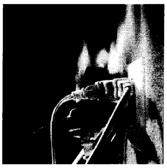
Overloaded outlet and circuit.